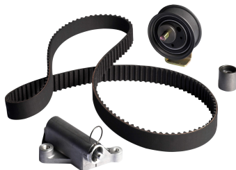
Tensioning pulley replacement