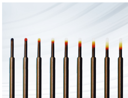
Glow plug pre-heating