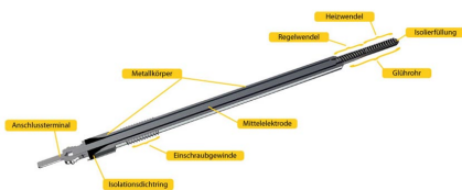
Cross-sectional view of metal rod glow plugs