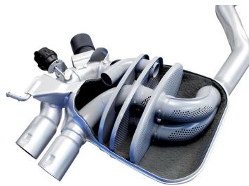
End silencer shells